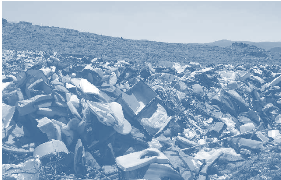
Discarded life-jackets that had been used by the refugees.