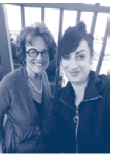
with G House to support Reiner the youth integrating

Run by the Larkin Street Youth Services. G-House — a 20-bed housing program for San Francisco homeless young adults (ages 18-24, transitioning from adolescence to adulthood) - provides residents with the tools they need to remove the obstacles that threaten their successful transition to independent living.