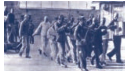
Mauthausen