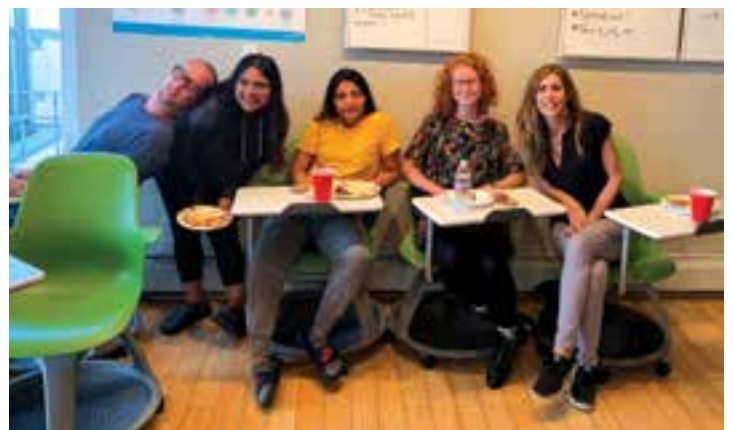
Geary House volunteers

Thank you for your generosity and flexibility in accommodating the needs of GHouse during the pandemic. We look forward to resuming in-person dinners when it is safe!