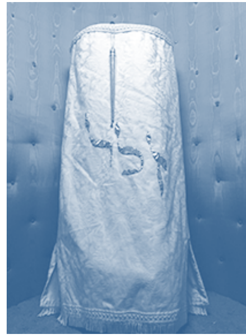
Czech Torah scroll (MST #221)

studying of the Torah, I knew I wanted to be a psychoanalyst. I became a Jungian analyst. All of my spiritual yearnings I poured into my Jungian studies.” Then, going even further, she later integrated homeopathy into her professional practice.