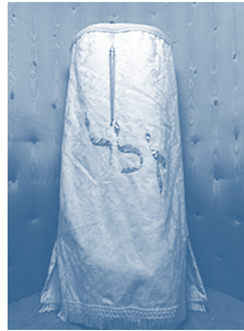
Czech Torah scroll (MST #221)

studying of the Torah, I knew I wanted to be a psychoanalyst. I became a Jungian analyst. All of my spiritual yearnings I poured into my Jungian studies.” Then, going even further, she later integrated homeopathy into her professional practice.